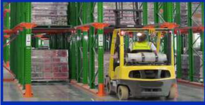
DRIVE-IN / THRU