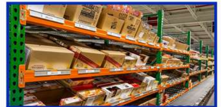
PALLETS & CARTON FLOW