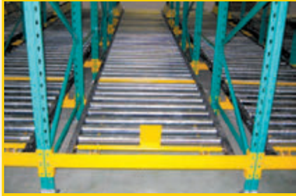
GRAVITY FLOW RACKING