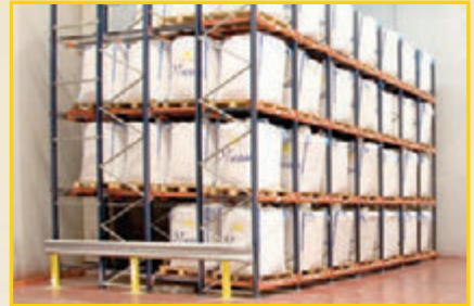
PUSH BACK RACKING