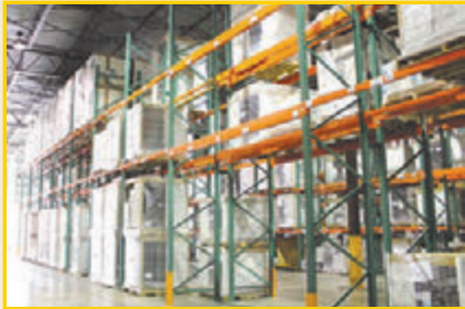
SELECTIVE PALLET RACK