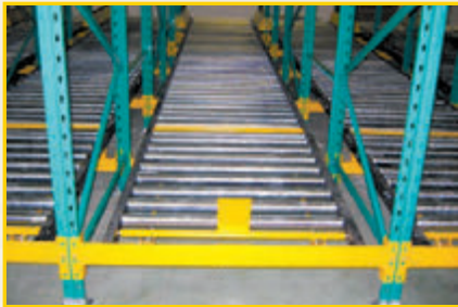
GRAVITY FLOW RACKING